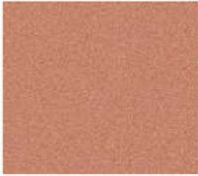
Canyon Vista FRBL 98651 SRBL 910978