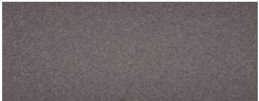
Natural Concrete FRBL 910463 SRBL 910973

Please be advised that variations in color, texture, and finish may occur with certain powder coating special effects. Such variations are common within industry standards and do not constitute a defect in the product. Customers are encouraged to perform their own tests to ensure that the final results meet their specific requirements.