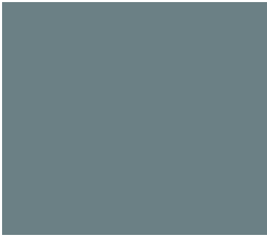
Blue Tile Shimmer FRML 910637 SRML 910990