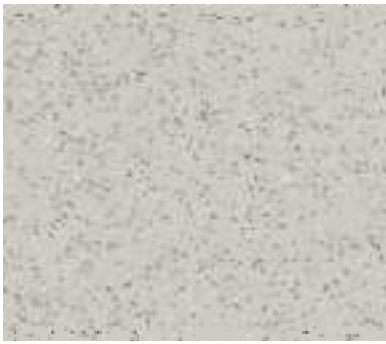
Stepping Stone FRBL 99972 SRBL 910977