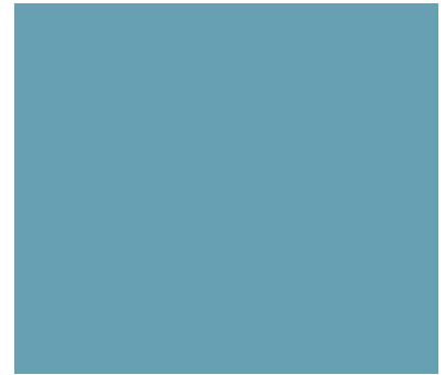
Town Blue FRML 910636 SRML 910987