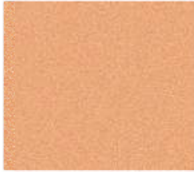
Biscotti FRBL 98652 SRBL 910979