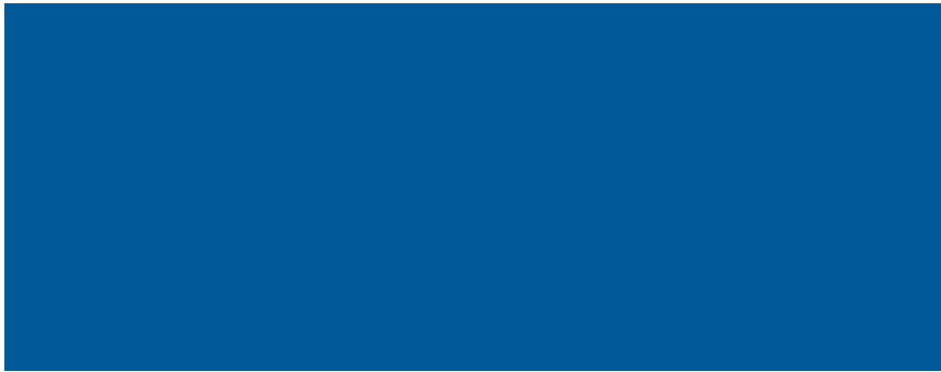
Blue FRSL 24327 SRSL 24577