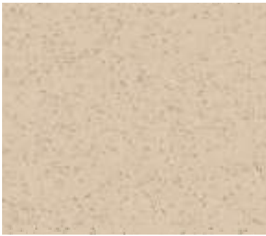
Speckle Glaze FRBL 99973 SRBL 910974