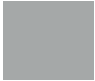
Arcadia Silver Bonded FRML 98890 SRML 910993