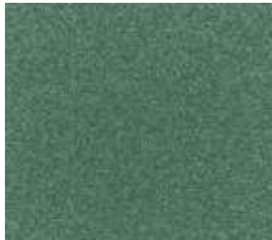
Green Terra Cotta FRBF 910210 SRBF 910985