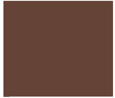
Core Ten FRBL 99646 SRBL 910980