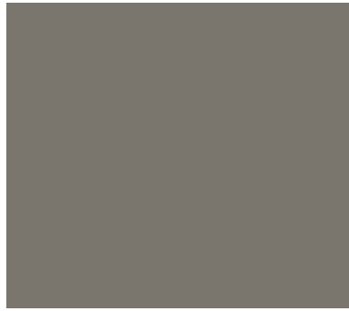
Lexus Zinc Bonded FRML 99248 SRML 910991