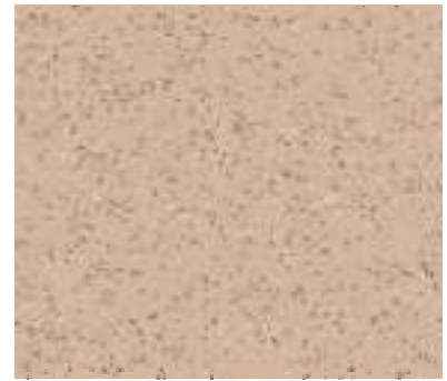
Beige Marble FRBL 99599 SRBL 910976