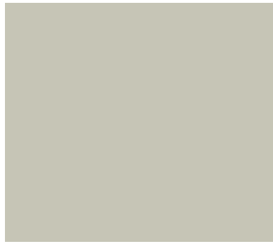
Austere Gray Sparkle FRML 910321 SRML 910972