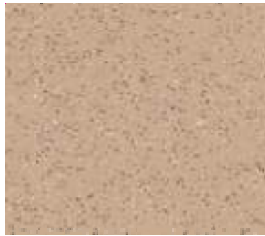
Dappled Sand FRBL 910462 SRBL 910975